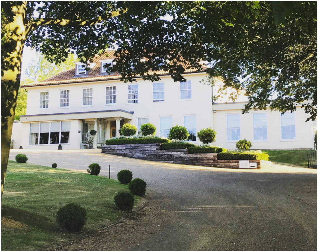
The Pheasant Hotel.

Our tour will feature luxurious accommodation at The Pheasant Hotel, locally sourced cuisine, and a carefully paced itinerary. There is no better way to discover the special charms of Norfolk!