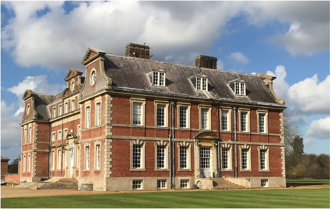
Raynham Hall.