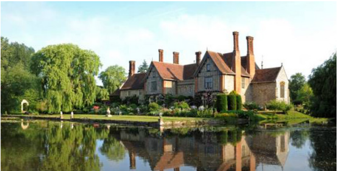
Elsing Hall.