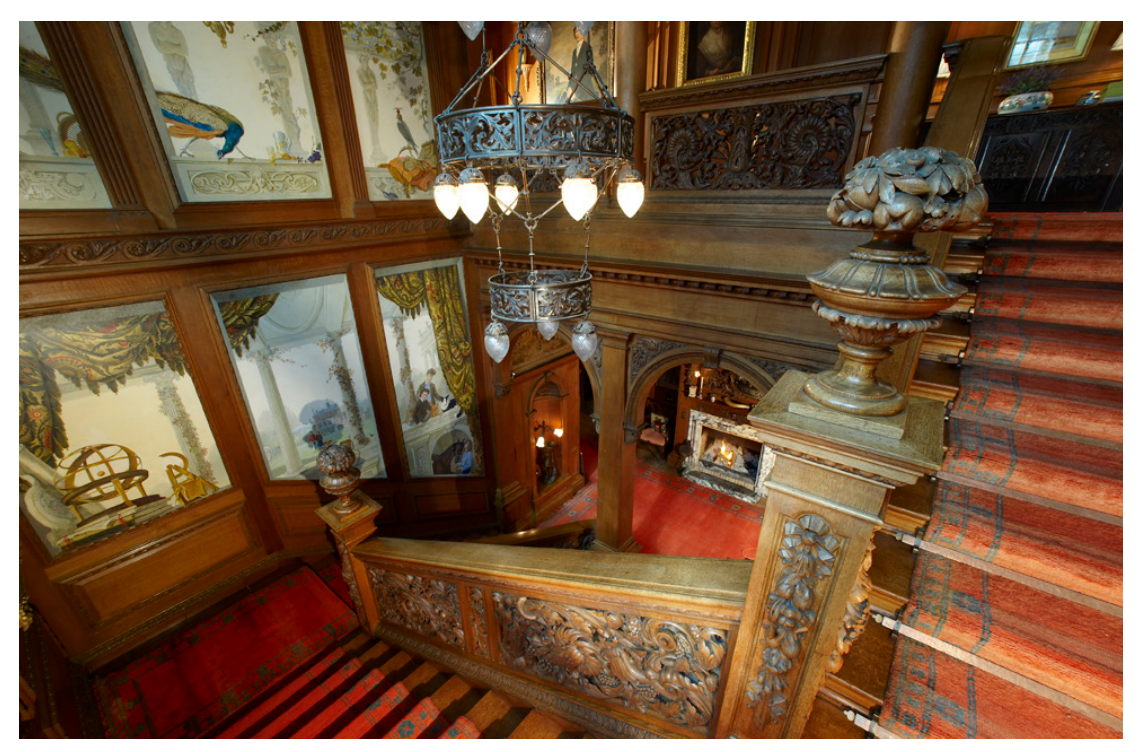
Sennowe Hall.