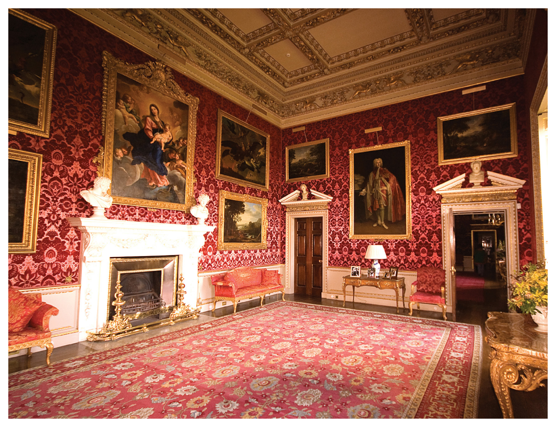
The Drawing Room at Holkham Hall.