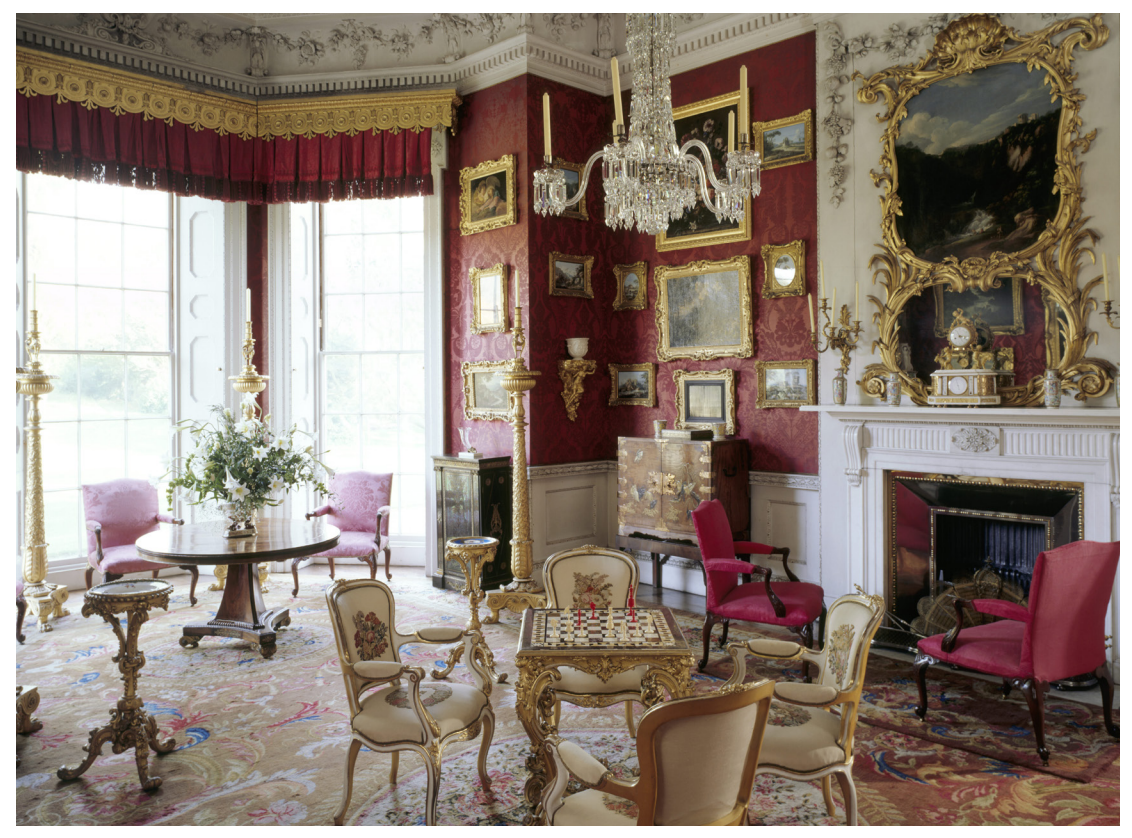
The Cabinet Room at Felbrigg Hall.