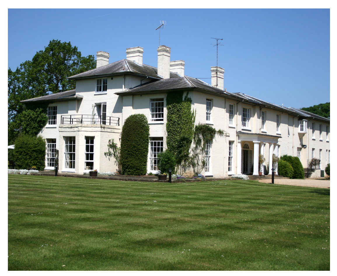
Congham Hall Hotel & Spa. By kind permission of Congham Hall Hotel & Spa.

Our tour will feature luxurious accommodation at the secluded Congham Hall Hotel & Spa, locally sourced cuisine, and a carefully paced itinerary. There is no better way to discover the special charms of Norfolk!